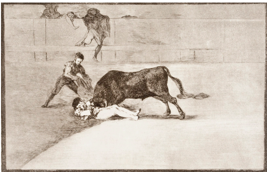
Francisco de Goya y Lucientes (Spanish, 1746–1828) Tauromaquia: The Unlucky Death of Pepe Illo in the Ring at Madrid (La Desgraciada Muerte de Pepe Illo en la Plaza de Madrid), 1816

Etching, burnished aquatint, lavis, drypoint and burin on laid paper Plate: 9 5/8 x 88.9 in (24.5 x 35 cm); sheet: 11 x 15 1/8 in. (28 x 38.4 cm) Norton Simon Art Foundation M.1979.64.31.G