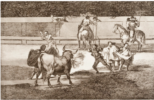
Francisco de Goya y Lucientes (Spanish, 1746–1828) Tauromaquia: Banderillas with Firecrackers (Banderillas de Fuego), 1816

Etching, burnished aquatint, lavis, drypoint and burin on laid paper Plate: 9 5/8 x 14 in. (24.5 x 35.5 cm); sheet: 10 7/8 x 15 1/8 in. (27.6 x 38.4 cm) Norton Simon Art Foundation M.1979.64.21.G