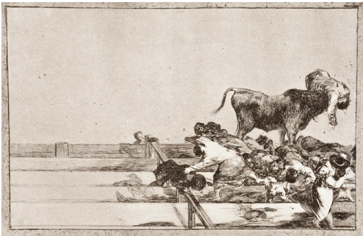
Francisco de Goya y Lucientes (Spanish, 1746–1828) Tauromaquia: Dreadful Events in the Front Rows of the Ring at Madrid and Death of the Mayor of Torrejon (Desgracias Acaecidas en el Tendido de la Plaza de Madrid, y Muerte del Alcalde de Torrejon), 1816

Etching, burnished aquatint, lavis, drypoint and burin on laid paper Plate: 9 5/8 x 14 in. (24.5 x 35.5 cm); sheet: 11 1/4 x 15 3/16 in. (28.6 x 38.6 cm) Norton Simon Art Foundation M.1979.64.20.G